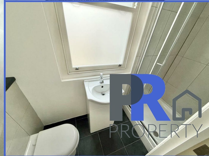
Flat 1, 79 High Town Road, Luton, Bedfordshire, LU2 0BW £850